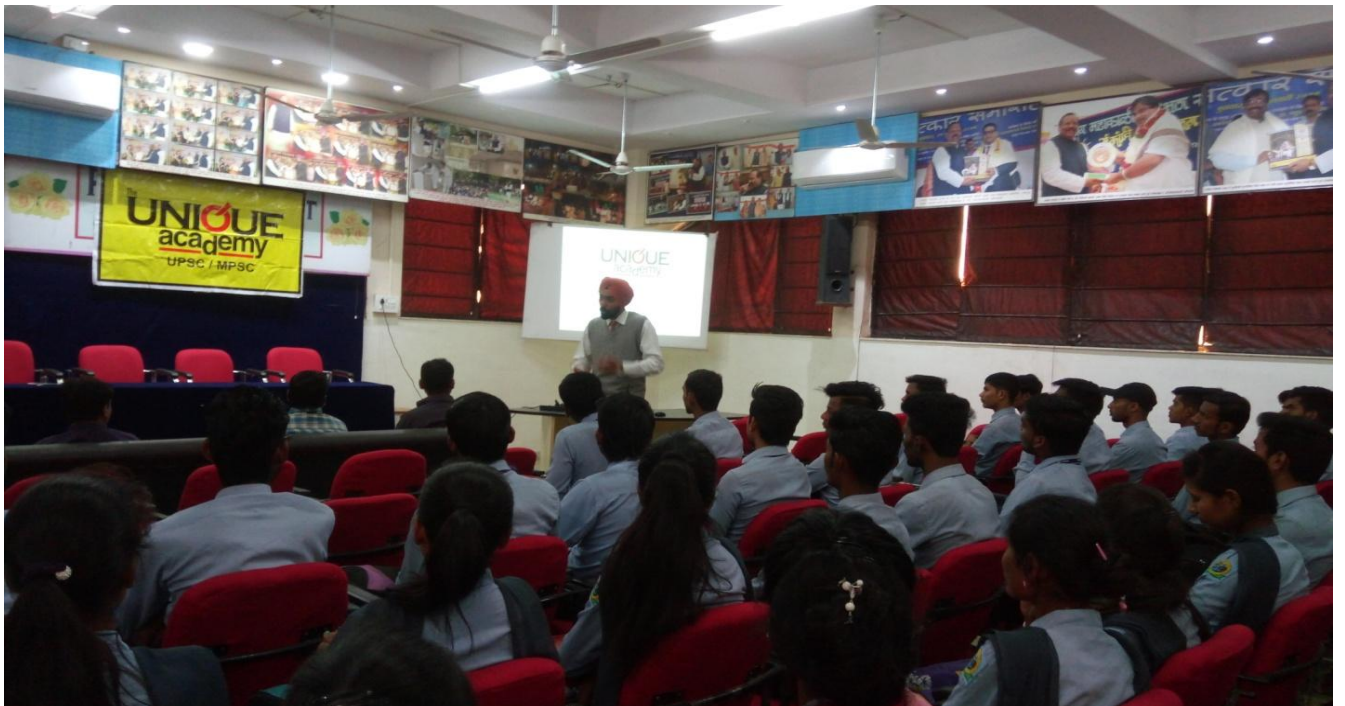
Event 43.Photos of Career Guidance Seminar on topic of UPSC